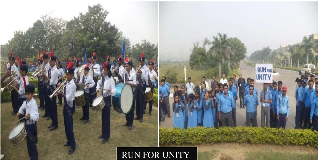
RUN FOR UNITY

“United we stand and divide we fall”. A special programme was organised on the occasion of Swami Vivekanand Ji's Jayanti for emphasizing his motto the “Unit is Strength”. Childrens participated in the activity with great real and enthusiasm