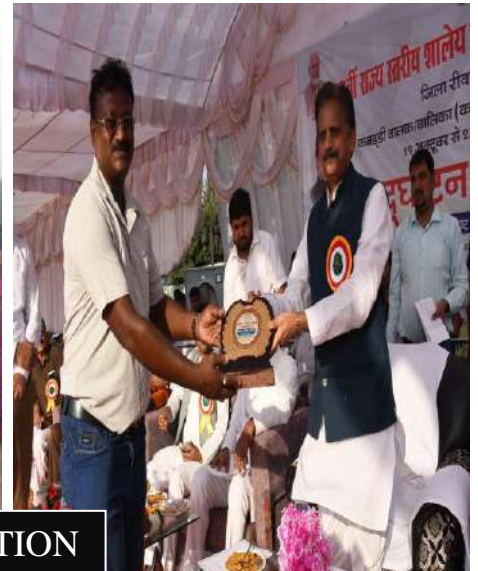
STATE LEVEL BAND COMPETITION