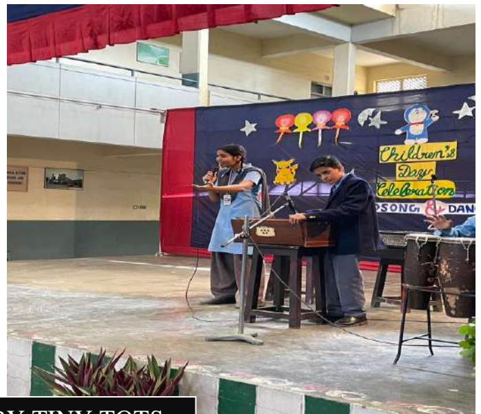
ACTIVITIES BY TINY TOTS