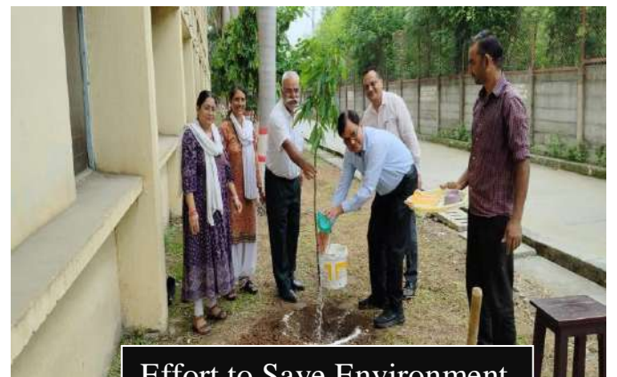
Effort to Save Environment