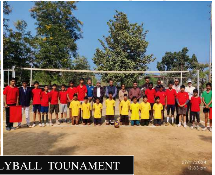
INTER SCHOOL VOLLYBALL TOUNAMENT