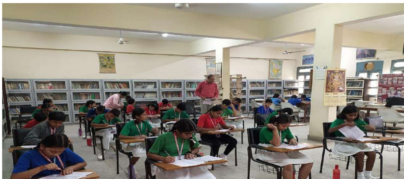
भारतीय संस्कृति ज्ञान परीक्षा

इस प्रतियोगिता के माध्यम से बच्चों ने भाषा एवं संस्कृति के प्रति अपनी रुचि दिखाई।