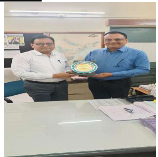
YOUTH IDEATHON 2024