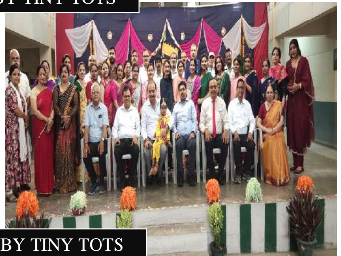
ACTIVITIES BY TINY TOTS