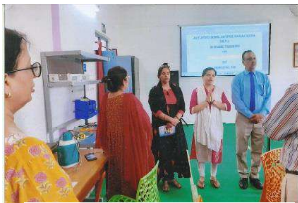
Teachers Training Workshop