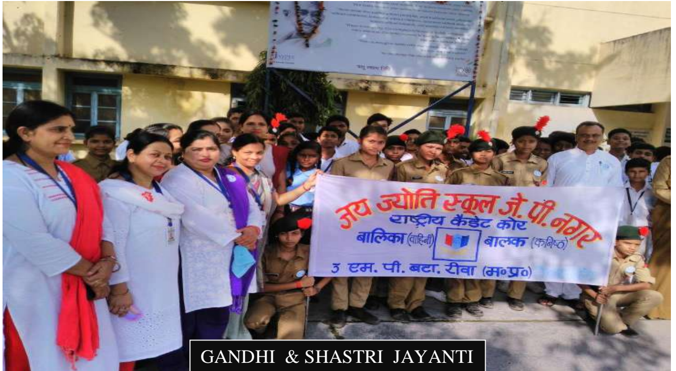
GANDHI & SHASTRI JAYANTI

The School celebrated birth anniversary of Mahatma Gandhi (Bapu) and Shri Lal Bahadur Shastri on 02 nd Oct. 2024 and a fortnight long programme on Gandhiji's life. His teachings were presented through different special programmes and activities. Shastriji's simplicity was also covered in the school assembly.