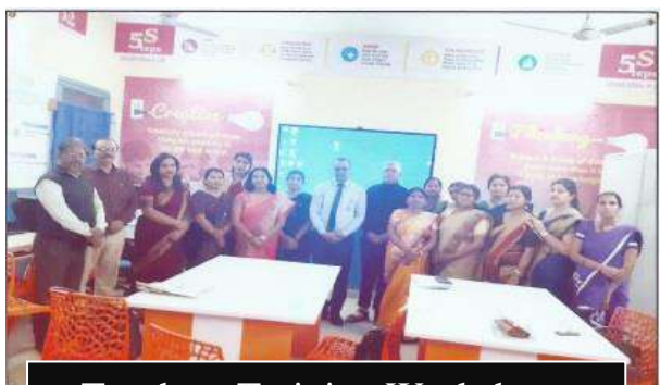
Teachers Training Workshop