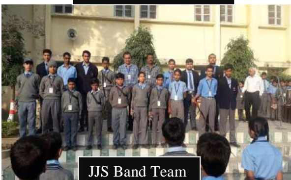
JJS Band Team